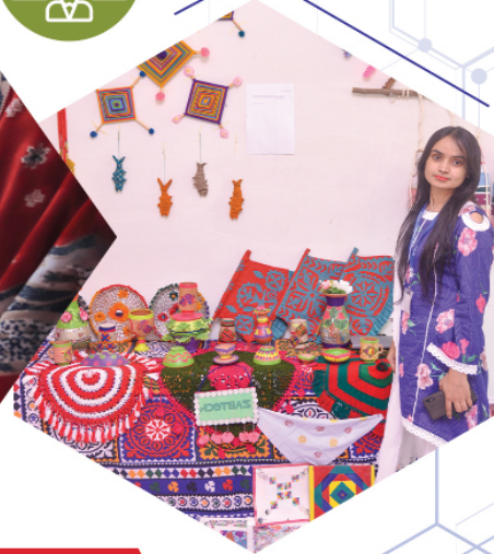
Trainees cherishing & demonstrating their practical learning at ZABTech Chapters