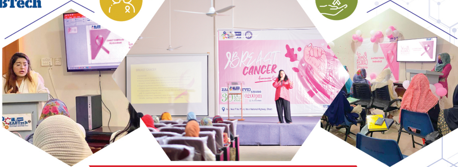
Breast Cancer Awareness Sessions organized by ZABTech Chapters