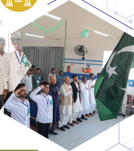
Pakistan Day celebration by trainees at ZABTech Gharo (Thatta)