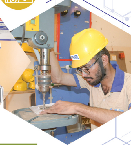
Trainees of Industrial Electrician doing their practical work at ZABTech Chapters