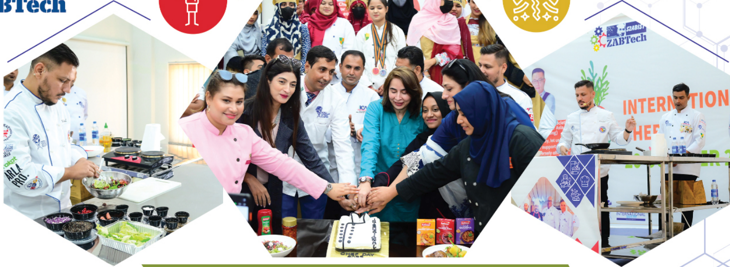
International Chef Day Celebration along with Live Cooking Class at ZABTech Gharo (Thatta)