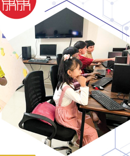
Young trainees enjoying learning during Summer Program at ZABTech Hyderabad