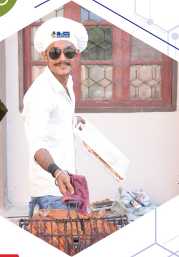
Culinary Arts & Hospitality Management trainees doing practical work at ZABTech Chapters