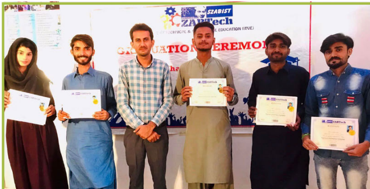
Certificate Distribution Ceremony held at SZABIST ZABTech (iTVE) KHP.