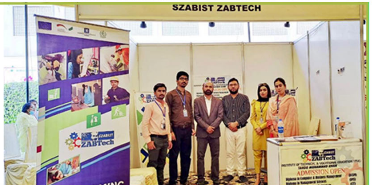
SZABIST ZABTech (iTVE) TMK participated in EDU-CLAN 2022 (Educational Expo).